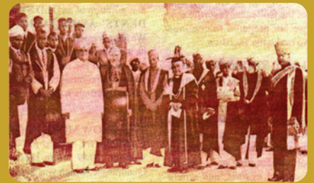
Formal Inauguration of the College, on 9 th October, 1946 by His Highness the Maharaja of Mysore

The College offers multidisciplinary Under Graduate Programmes under the National Education Policy (NEP-2020) of Govt. of India and 10 Post Graduate Programmes in Arts, Science, Commerce, and Management Disciplines. The UG & PG Programmes are offered with Learning Outcome Based Curriculum Framework (LOCF)