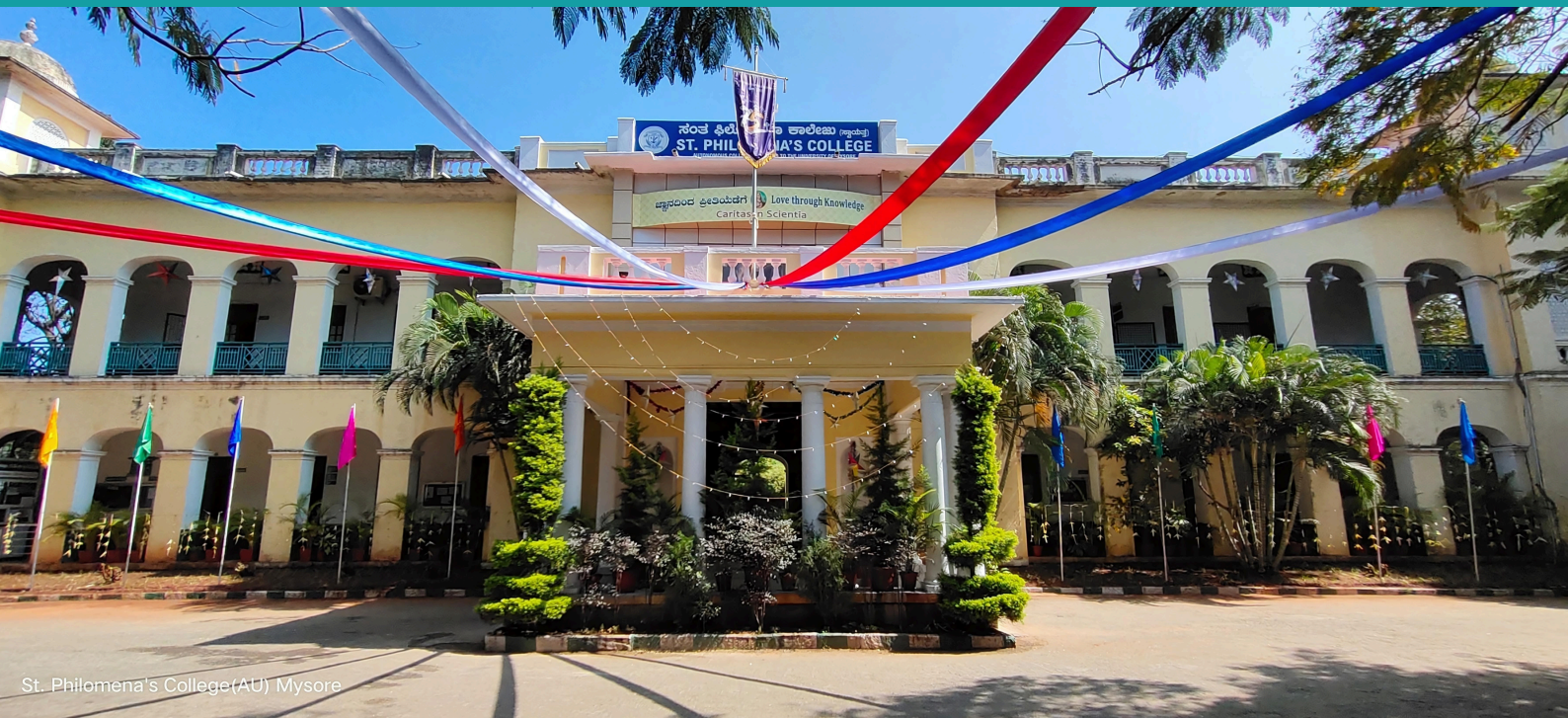
St. Philomena's College(AU) Mysore