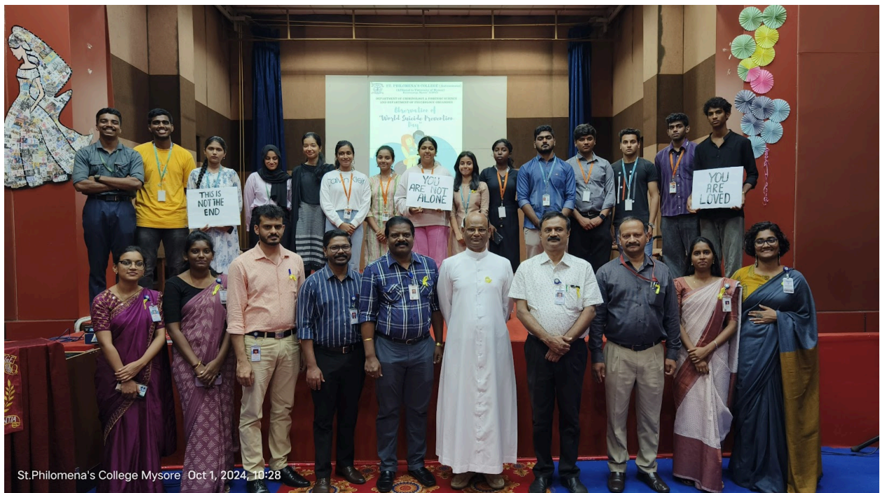
The team for "World Suicide Prevention Day" observance