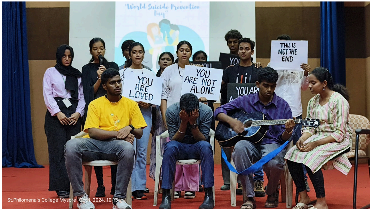
Pic 3 and 4: Scenes from the play presented on "World Suicide Prevention Day"