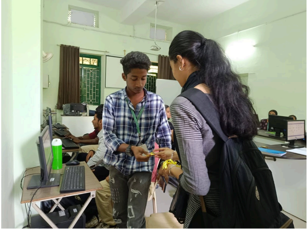
Pic 6 and 7: Distribution campaign by students to spread Awareness